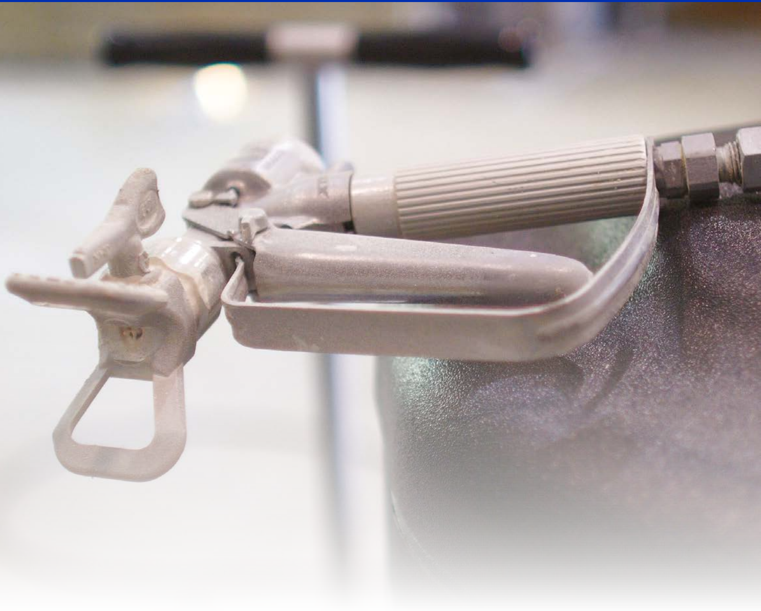
ORIFICE SIZE - MM (INCHES)