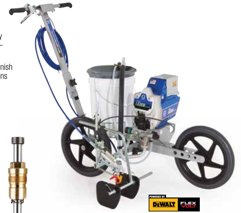
POWERED BY DEWALT FLEXVOLT