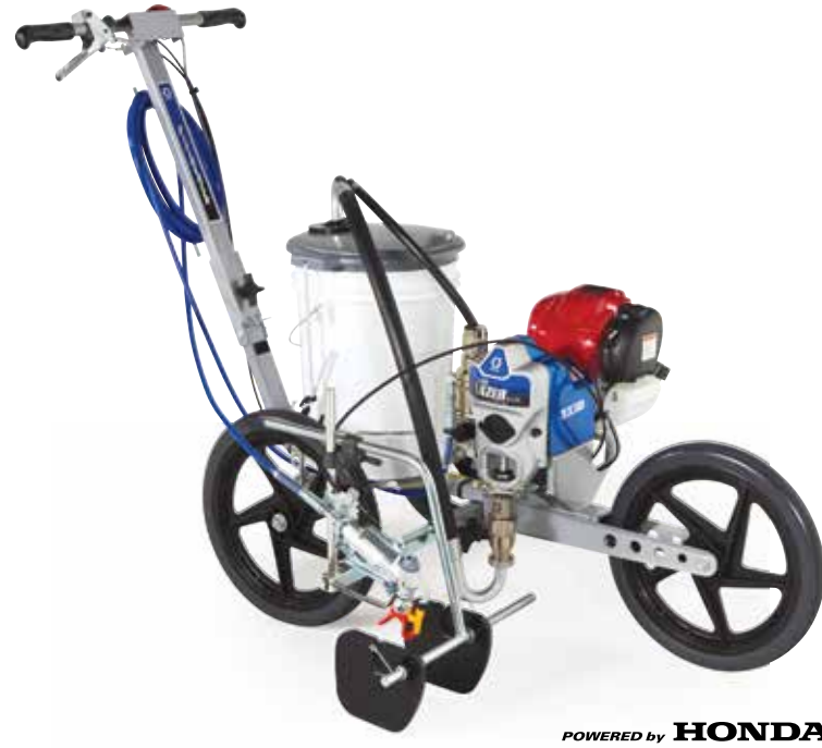
POWERED BY HONDA

Introduced in 2004, the FieldLazer S100 set the standard for airless field marking and is now recognized by industry professionals as one of the top walk-behind field marking machines available.