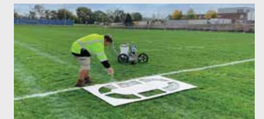
No-Tool Gun Removal for spraying stencils or large solid areas.