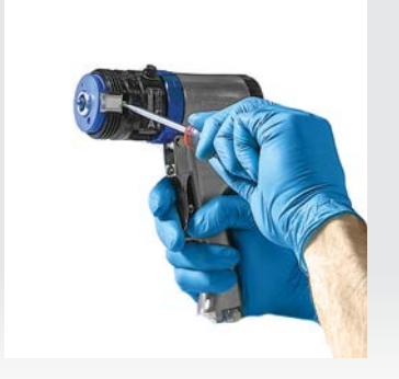
Remove the cartridge