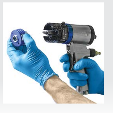
Press the new PC fluid cartridge onto the mix chamber