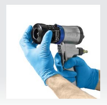
Remove the aircap and retaining ring

How to remove and replace a Fusion ProConnect cartridge: