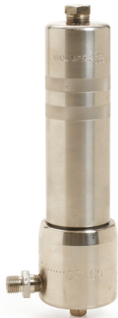
Stainless Steel High Pressure Filter Part No. 26A069