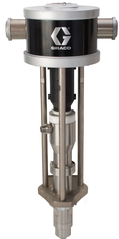
Merkur Bellows Pump

All written and visual data contained in this document are based on the latest product information available at the time of publication. Graco reserves the right to make changes at any time without notice.