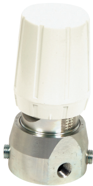
High Pressure Fluid Back Pressure Regulator Part No. 26A081