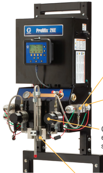
ProMix 2KE Meter System