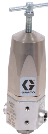
High Pressure Regulator Part No. 26A085